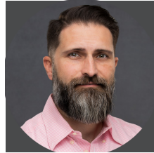
JOSH CARROLL SnapMe Creative